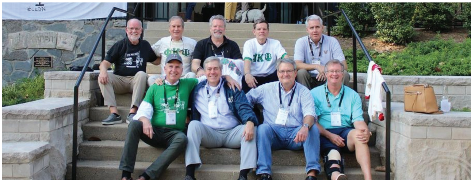
PHOTO GALLERY Homecoming/Reunion Open House