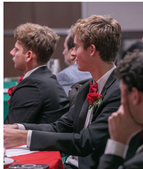
Members and guests of Tennessee Delta Rechartering Ceremony seated at dinner tables.

As we officially became a charter on November 2, 2024, it was clear that our journey had done more than increase our numbers or give us a title. We had built something meaningful, rooted in service, integrity, and respect for one another. We had become not just a fraternity, but a true brotherhood. This journey has shown us the power of unity, the importance of philanthropy, and the strength that comes from perseverance. The path to becoming a charter was long, but every step, every challenge, and every triumph along the way made it worthwhile.