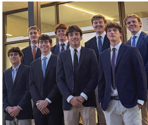
Fall Break: Nine brothers of the new member class recently initiated into the brotherhood.

For fall break last week, seniors travelled to Las Vegas with a large group of Vanderbilt students, the juniors visited a Tennessee Delta brother's farm in Ohio, and the sophomores travelled to a lake in the mountains of North Carolina.