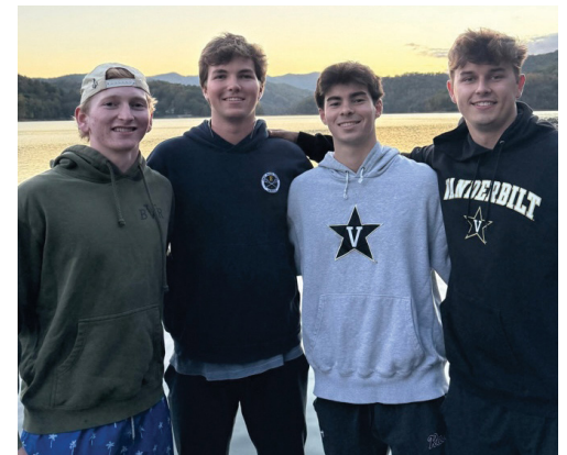
Fall Break: A group of Tennessee Delta seniors take a fall vacation to Las Vegas.